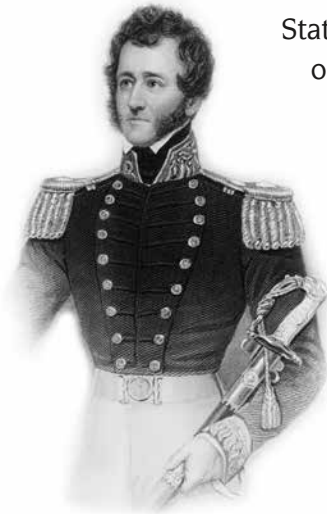
Commodore Robert F. Stockton

San Diego's Mexican era ended abruptly in 1846, when the United States declared war on Mexico. Initially the residents made little resistance to American occupation, but the situation eventually turned San Diego families against one another. Some remained loyal to Mexico, while others supported the United States. The town was occupied and won back several times—one major battle took place in nearby San Pasqual Valley. In 1846 U.S. Navy Commodore Robert F. Stockton captured San Diego. The war between Mexico and the United