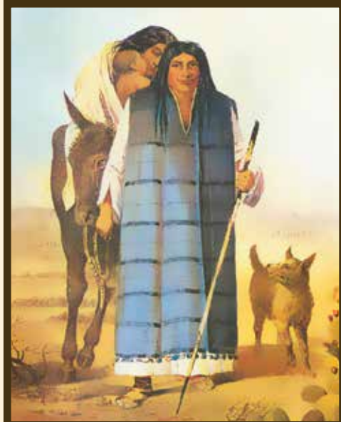
Kumeyaay Indians drawn by artist with the 1849 U.S. Boundary Commission expedition

The Kumeyaay lived on the San Diego River at a village they called Kosa'aay . For thousands of years, the people migrated between ocean and mountains—gathering seafood, acorns, and the necessities of life. Today a native-plant landscape marks part of the territory of that early settlement before arrival of the Spaniards. At first, the Spanish settlers were welcomed by the Kumeyaay, but challenges to traditional ways increasingly affected their lives. Kumeyaay culture proved resilient, and today many Kumeyaay proudly continue their traditions with modern adaptations.