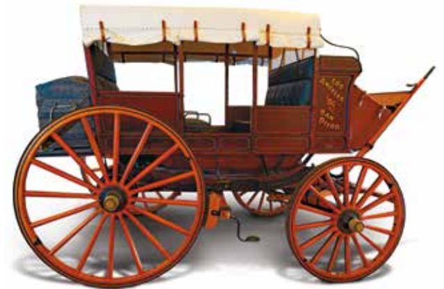
Reproduction of Seeley line mudwagon at the Seeley Stables Museum

In 1867 San Franciscan Alonzo Horton arrived in San Diego to begin building nearby New Town. Old Town enjoyed a slight resurgence in