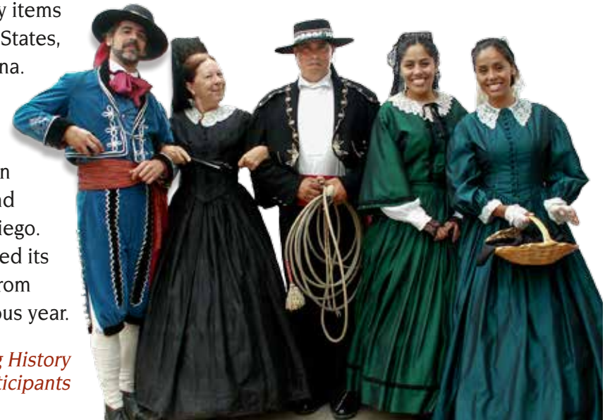
Living History participants

Spanish soldiers began building residences below Presidio Hill in the early 1820s. Sun-dried adobe brick was their traditional building material, since wood was scarce. Soon five houses belonging to the Carrillo (and later Fitch), Ruiz, Ybañez, Serrano, and Marron families became the nucleus of the community. By 1825, the adobes formed a rough but orderly street pattern around an open plaza. Two of the finest structures, begun in 1827 and