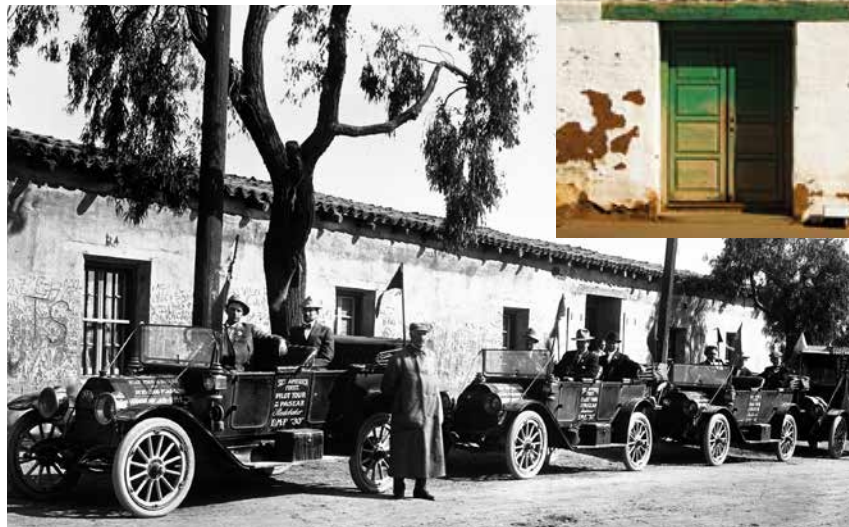
Top: Casa de Estudillo; Bottom: Auto touring, ca. 1920s

section's appearance as a "Spanish village" in the 1930s.