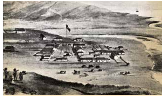
Old Town San Diego, 1846

In 1822 a Mexican military command arrived in San Diego. Mexico had gained its independence from Spain the previous year.