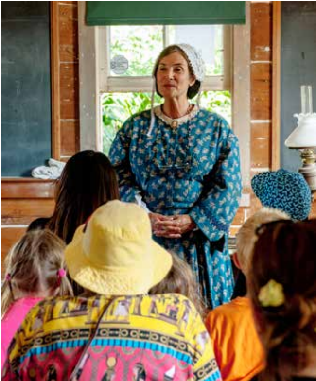
Living History: an educational tour listens to a school teacher from 1865

Today's plaza remains the heart of Old Town, allowing visitors to discover the lives of those who came before them and to better understand California's beginnings.