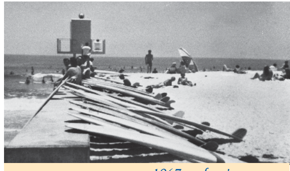
1967 surfers' mecca

In the late 1930s, the Civilian Conservation Corps (CCC) constructed campgrounds, picnic areas, and the custodian's lodges at Doheny beach and at nearby San Clemente. The sole CCC remnant at Doheny is a plaster and tile wall and entryway near the campground.