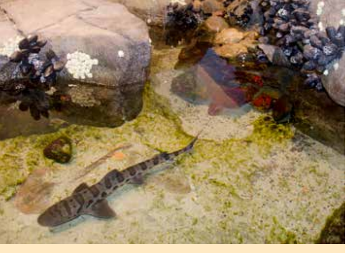
Experience many tide pool residents at the visitor center's exhibits.

skills, and ocean-oriented activities. For more information, call (949) 496-6162 or visit www.dohojg.com.