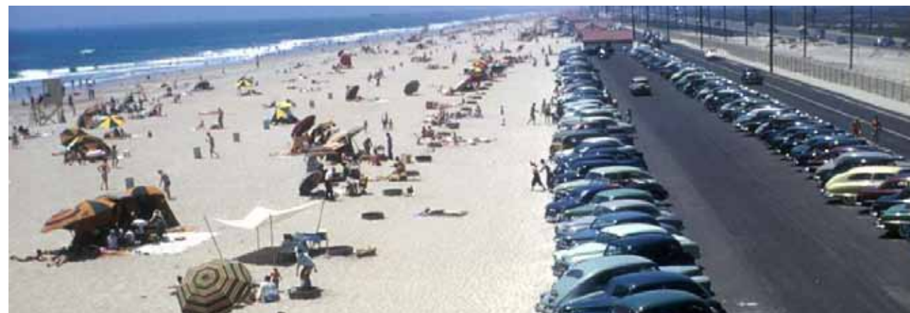
Huntington Beach, ca. 1950

Spanish King Carlos III wanted to expand Spain's presence in Baja California north to Alta California in the mid-1700s. Soldiers and missionaries claimed the native people's land to establish military presidios, religious missions and villages.