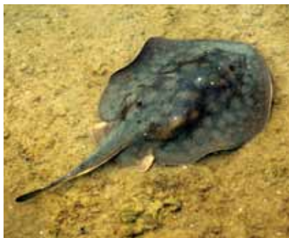
California round stingray

shallow, calm waters. The gray or mottled brown rays vary in size; stings from their barbs are painful.