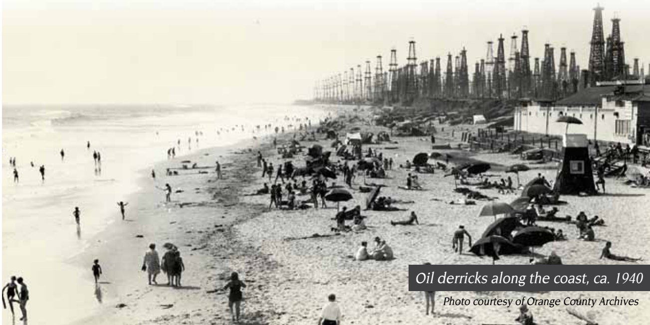
Oil derricks along the coast, ca. 1940

Camping — Huntington State Beach is for day use only. Bolsa Chica has more than 50 campsites with electric and water hookups for self-contained RVs. Tent camping is not allowed. For RV camping reservations, call (800) 444-7275 or visit www.parks.ca.gov up to seven months in advance.