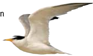
California least tern

California round stingrays ( Urobatis halleri ) also lurk offshore at flat, sandy beach breaks like Bolsa Chica. Stingrays feed in somewhat