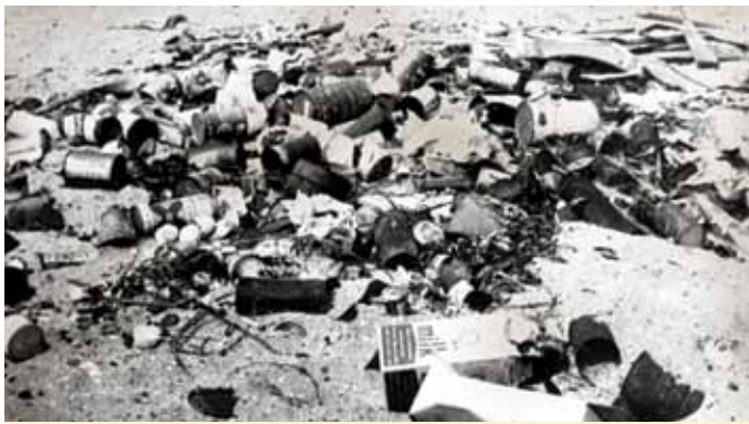
"Tin Can Beach", ca. 1960

Nearby, Post-World War II beachgoers seeking an escape from valley heat pitched canvas tents or shacks and slept on the unfenced sand at Bolsa Chica in the 1940s and '50s. The litter left by visitors earned Bolsa Chica the nickname "Tin Can Beach." Eventually, local residents convinced the State to buy the eyesore; Tin Can Beach became Bolsa Chica State Beach in 1963.