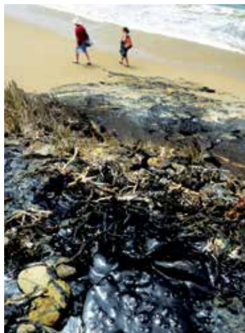
Natural tar oozing on beach

Natural tar deposits seep to the surface on the coastal bluffs and on the sand at the southeast end of the beach, forming bulging, black mounds.