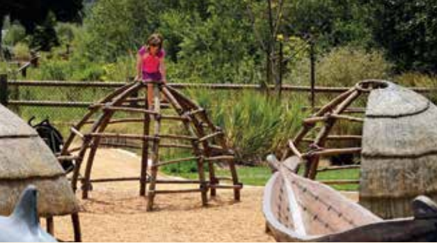
Tomol Interpretive Play Area

mallards, egrets, herons, coots and other birds. Do not disturb the bird habitat by playing or wading in the creek.