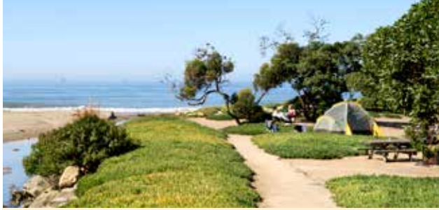
Campsites along Carpinteria Creek and the Pacific Ocean

Juan Rodriguez Cabrillo, the first European to have contact with the Chumash