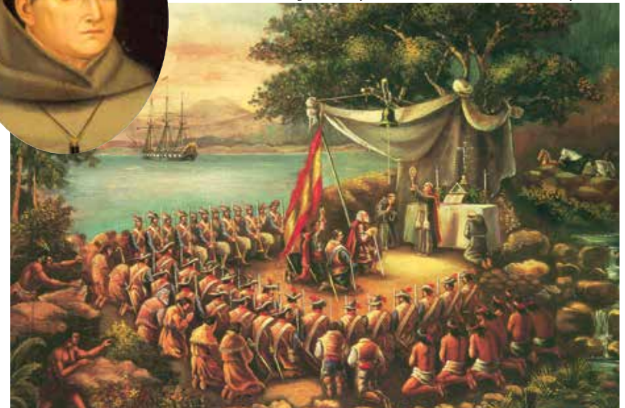
Inset: Father Junípero Serra. Bottom: Dedication of the second mission in Alta California at Monterey, by L. Trousset, 1870