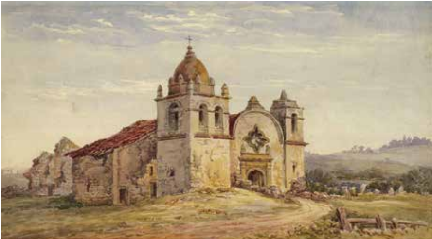
Mission San Carlos Borromeo, by Edwin Deakin, ca. 1900