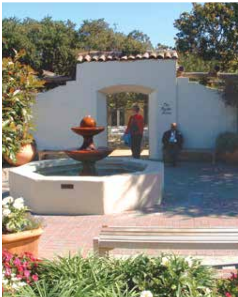
The Pacific House's Sensory and Memory Gardens

The Pacific House Museum, the Stevenson House, the Custom House, and the First Brick House are generally accessible. However, some accessible structures are only open to guided tours at specific times.