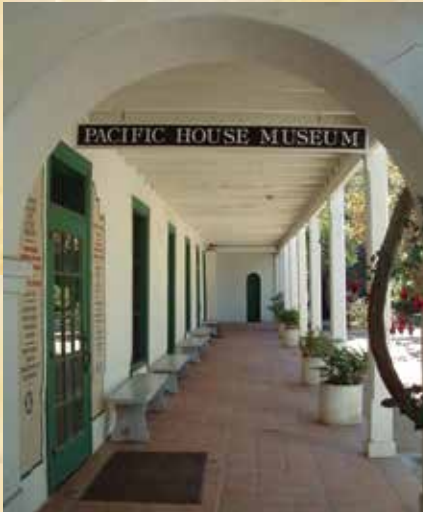
Pacific House Museum