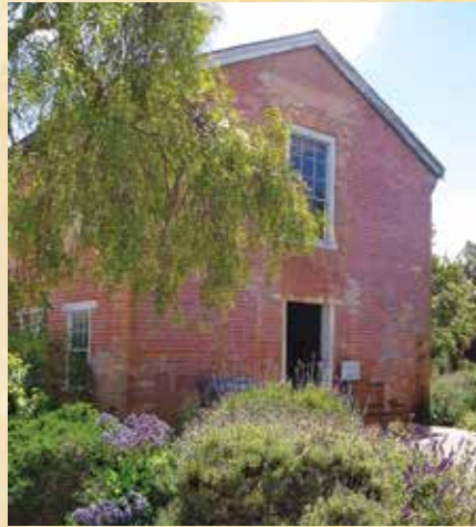
First Brick House