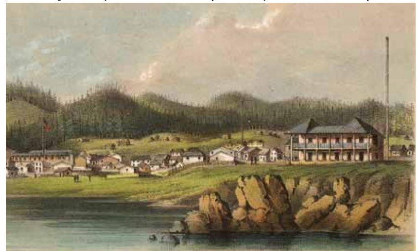
View of Monterey looking inland, by Bayard Taylor, ca. 1850