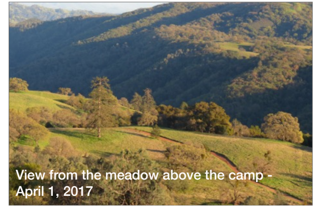
View from the meadow above the camp - April 1, 2017