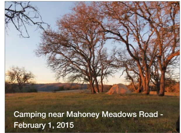
Camping near Mahoney Meadows Road - February 1, 2015