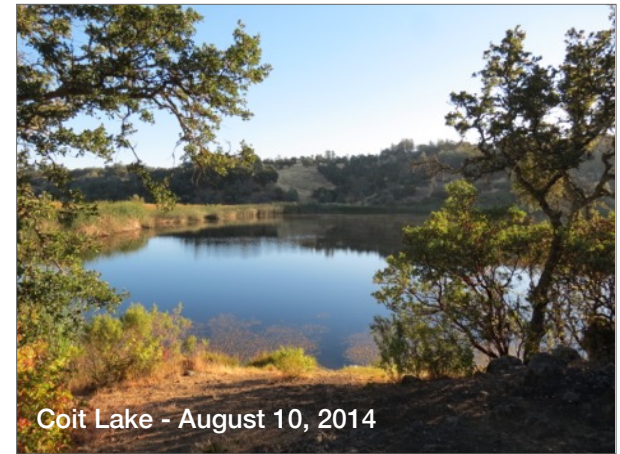
Coit Lake - August 10, 2014