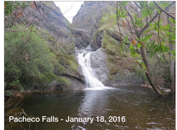
Pacheco Falls - January 18, 2016