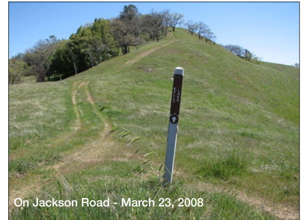
On Jackson Road - March 23, 2008