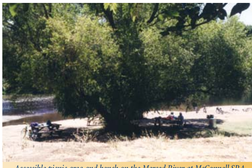
Accessible picnic area and bench on the Merced River at McConnell SRA

The typical Central Valley climate can reach from 90 to as much as 105 degrees in the summer, with mild spring and fall temperatures. In winter the weather can drop to below freezing. The average annual rainfall is 12 inches.