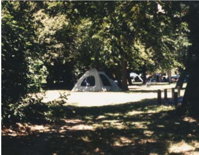
Campground at McConnell SRA

When park personnel are not on duty, campers will find convenient self-registration envelopes for paying camping fees. Firewood is available at the park office,