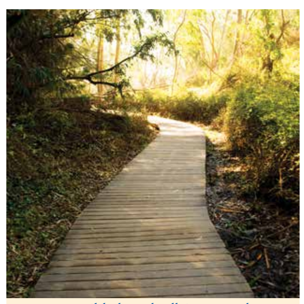
Accessible boardwalk in monarch grove