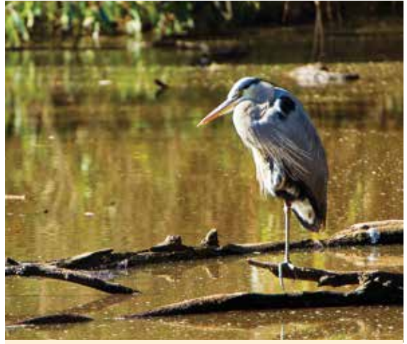
Great blue heron at Moore Creek

located between the edge of the ocean and the outer limits of the city of Santa Cruz. This popular 65-acre park is known for its wave-carved sea arch. family-friendly beach, tide pools, and visiting monarch butterflies.