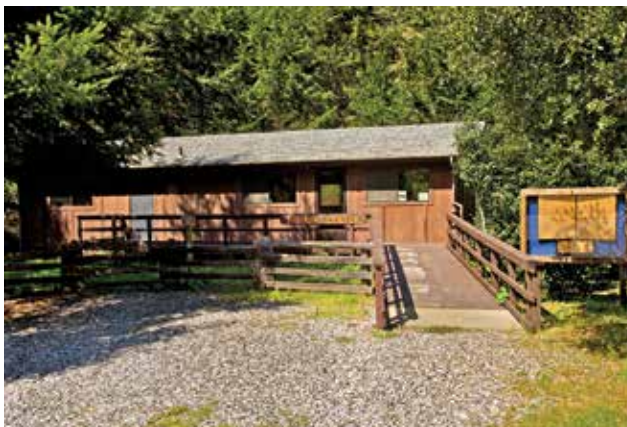
Accessible visitor center

Hiking —Inviting trails allow visitors to photograph mushrooms in January, spot newts in February and orchids in March, or to stroll among alders on Six Bridges Trail.