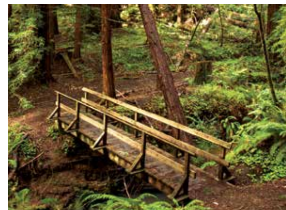
Bridge access over Butano Creek

Accessibility is continually improving. Visit http://access.parks.ca.gov for updates.