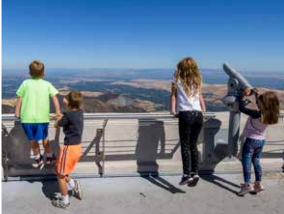
Children on the observation deck

beacon on the Mount Diablo summit. Originally lit (remotely) by Charles Lindbergh in 1928, the beacon, known as the Eye of Diablo, guided pilots traveling to the Bay Area. Visible for 100 miles, the beacon was turned off December 8, 1941, the day after the Pearl Harbor bombing for fear it might lead to an attack on California.