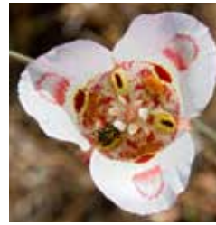
Clay mariposa lily

Mount Diablo is made of igneous, sedimentary, and metamorphic rock ranging from 190 million to 10 million years old B.C. Some of the rocks are composed of marine sediments containing the fossilized remains of ancient sea creatures. The summit is volcanic rock, erupted from undersea volcanoes thousands of miles to the west and transported to the area by movement of the earth's tectonic plates. Mount Diablo itself is not a volcano, but