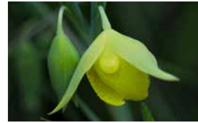
Mount Diablo globe lily