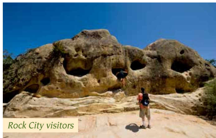
Rock City visitors

More than 50 picnic sites have picnic tables and barbecue stoves. Three group picnic areas serve from 20 to 50 people each. Over 50 individual campsites have nearby showers and flush toilets. Five group campsites have pit toilets and running water. To make reservations, visit www.parks.ca.gov or call (800) 444-7275.