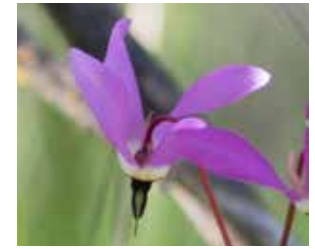
Padre's shooting star

was formed in the past couple million years by the folding and faulting of the earth's crust.