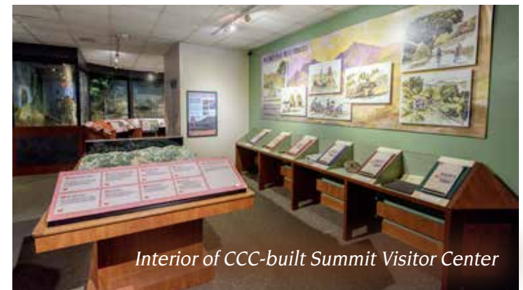
Interior of CCC-built Summit Visitor Center

In the early days of commercial aviation, Standard Oil installed an aerial navigation