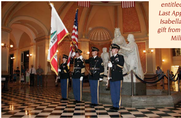
First floor Rotunda

In the heart of Sacramento on 10th Street between L and N Streets, California's State Capitol embodies the best of California's past and present. Forty acres of lawns, flower gardens and memorials to California history surround the building. Stately trees in Capitol Park, including many exotic species planted over 100 years ago, thrive in Sacramento's climate.