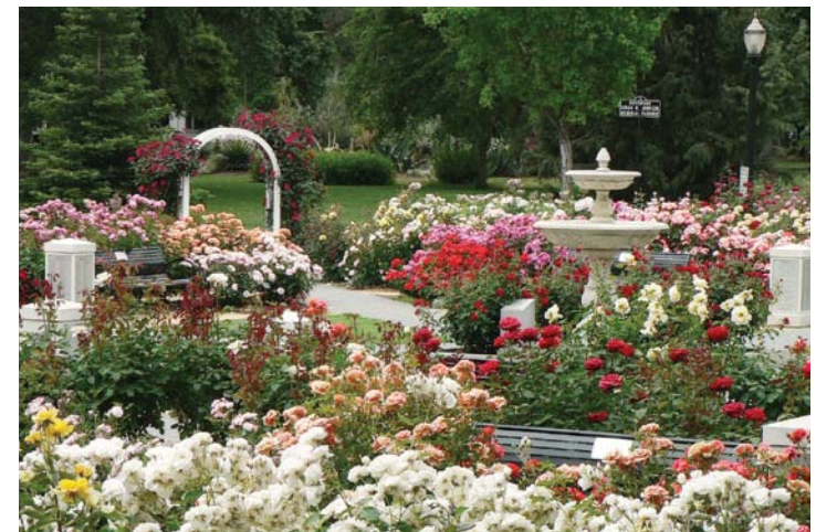
World Peace Rose Garden