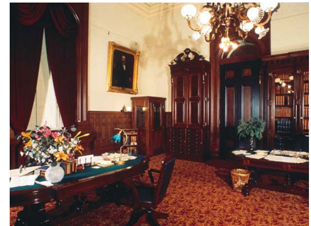
Historic Governor's Main Office—1906