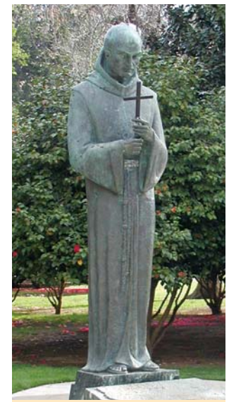
Father Junípero Serra