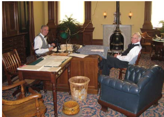
Living History Day

The State Capitol Museum presents free living history events. Election Day, 1906 Earthquake, Governor's Day and California Admission Day Living History Programs transport visitors back to the early days of California government. Costumed volunteers participate in these events.