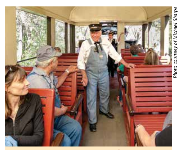
Open-air observation car

During the Great Depression, the Sierra Railway Company went into receivership, a form of bankruptcy in which the company is allowed to reorganize without losing the value of its property. On April 1, 1937, it was