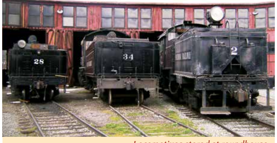
Locomotives stored at roundhouse

This historic site has had support from several advocacy groups. The California State Railroad Museum Foundation, an integral