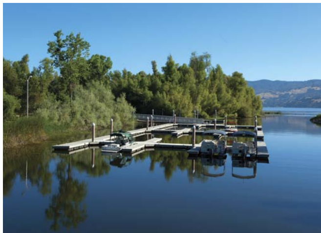
The park provides mooring and launching space.

Boat Launch —The boat launch and marina are located on the west bank of Cole Creek. The launch ramp is paved, lighted and usable year-round. Boat mooring slips are available first-come, first-served. Launch fees apply. Paved parking adjoins the marina, which has a shower and restroom.