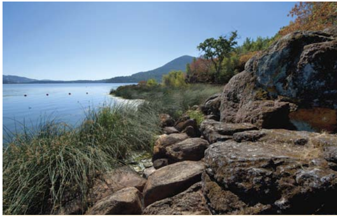
View of Mt. Konocti from the swim area

Park is located on the southwestern shore of California's largest natural lake. More than 120,000 visitors each year come to swim, fish, boat, waterski, picnic and camp. The park sits on the edge of Soda Bay, named for a spring of