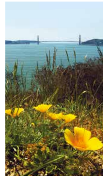
Golden Gate Bridge view

For more activity information, visit www.angelisland.com or call (415) 435-3392.