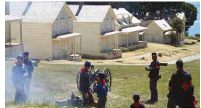
Civil War reenactment at Camp Reynolds

A 1940 fire destroyed the administration building, closing the Immigration Station. The first restoration phase of this National Historic Landmark has been completed as a tribute to immigrants from around the world.