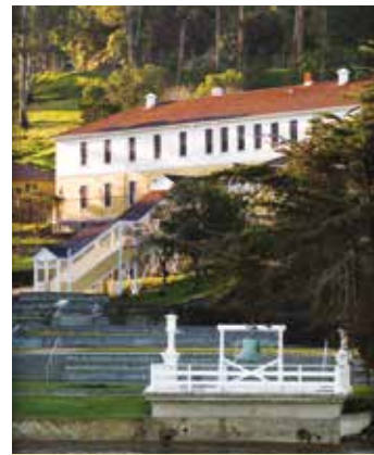
U.S. Immigration Station

From 1910 to 1940, the United States Immigration Station, nicknamed “the