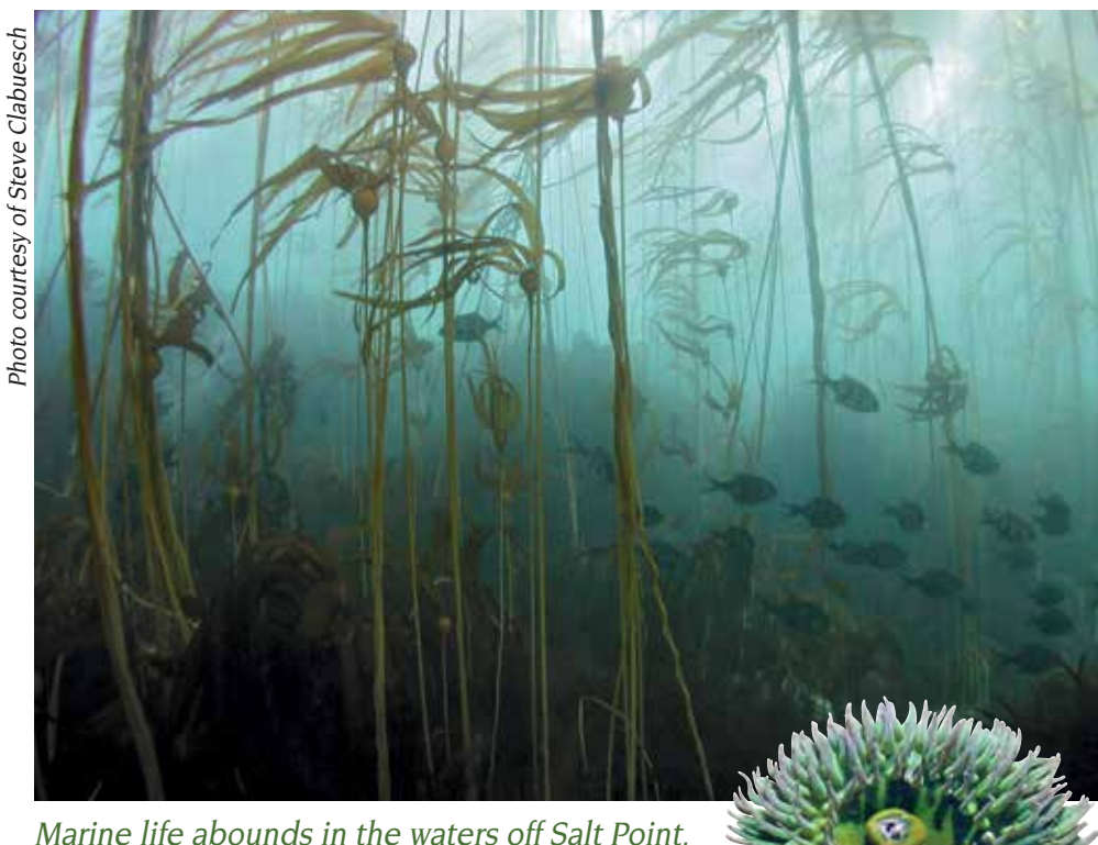
Aarine life abounds in the waters off Salt Point. Above: bull kelp forest; right: anemone.

Bull kelp thrives along the coast. In April, though the kelp is not yet visible, its growth has already begun. Attaching to rocks with a