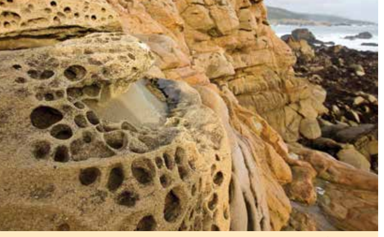
Tafoni formations in sandstone

Overflow Camping—A day-use parking lot below Gerstle Cove Campground is available for self-contained vehicles only (no tent camping or open fires). There are no restroom facilities, and you must bring your own drinking water. Fishing—Salt Point is a very good spot for surf fishing. In the Gerstle Cove State Marine Reserve and the Stewarts Point State Marine Reserve, marine life is completely protected. Abalone diving, spearfishing, and rod and reel fishing are