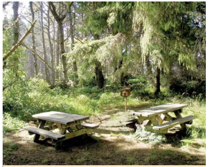
Fisk Mill Cove picnic area

Picnicking—Fisk Mill Cove, a day-use area with paved parking, picnic tables, upright barbecues, restrooms and drinking water, is shielded from the wind by Bishop pines. For a dramatic view of the Pacific Ocean. take a short walk from the north parking lot to Sentinel Rock's viewing platform. Stump Beach, one of the few sandy beaches north of Jenner, has some picnic tables near the parking lot and a primitive toilet, but no running water. A ¼-mile trail leads to the beach. Gerstle Cove also has picnic tables, a primitive toilet and a scenic view of the ocean. Trails—The park has more than 20 miles of hiking and equestrian trails—visit www.parks.ca.gov for details. Mountain bikes are not allowed on single-track trails because they can damage wet trail surfaces. Please stay on the trails to preserve the park's unspoiled gualities and to avoid contact with ticks and poison oak. Motor vehicles are permitted only on paved roads.