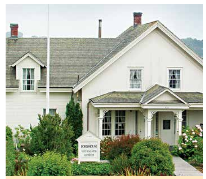
The Ford House Visitor Center

In 2002 California State Parks acquired 7,334 acres of land between Russian Gulch and Van Damme that begins near the Mendocino Headlands, where the Big River