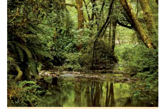
Little River, Van Damme State Park

The Pomo date back about 3,000 years on the North Coast. They built their main village of redwood bark houses at the mouth of Big River. The Pomo hunted large and small game, caught fish and shellfish, and gathered seaweed, acorns, and various seeds. Whatever they could not obtain locally, they acquired in trade with other groups; in times