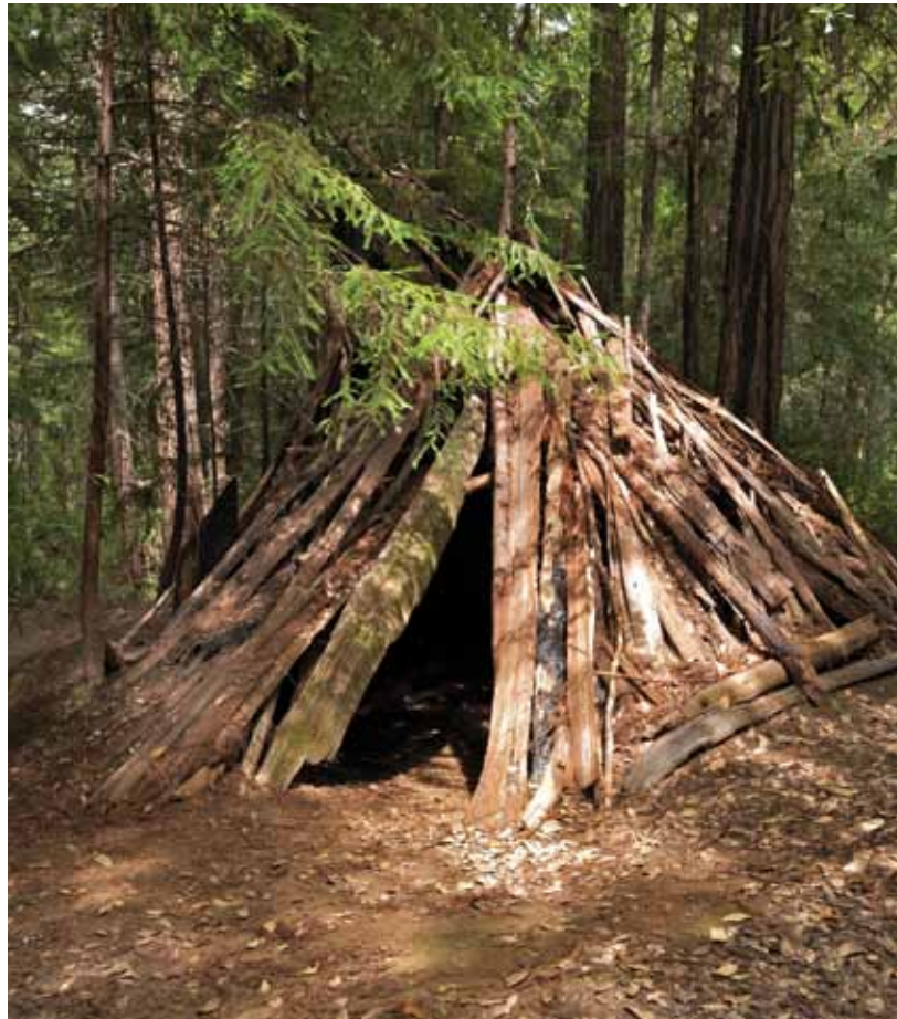
Hendy Hermit's hut

Picnicking —Near the banks of the Navarro River, 12 picnic sites with barbecue stoves and tables overlook the Big Hendy Grove.