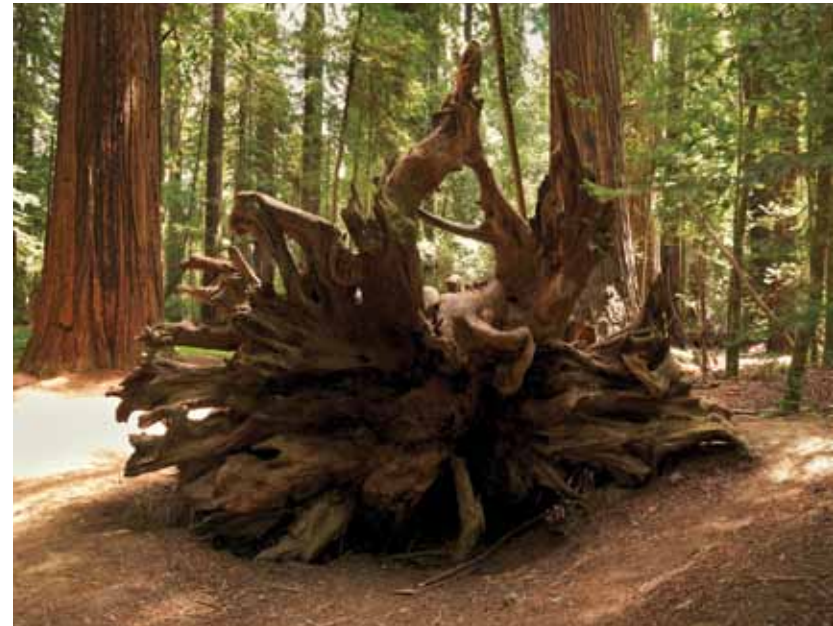
Fallen redwood tree root system

The most outstanding features of this 845-acre park are the two redwood groves on the flats along the Navarro River. Some of these trees stand more than 300 feet tall and may be close to 1,000 years old. Madrones, Douglas firs and California laurels share the cool shade of the redwoods. Massive stumps and fallen trees lie covered in moss. Beneath the old-growth giants, ferns and redwood sorrel blanket the ground, and soft, decomposed redwood duff mutes all sound to a mellow hush.