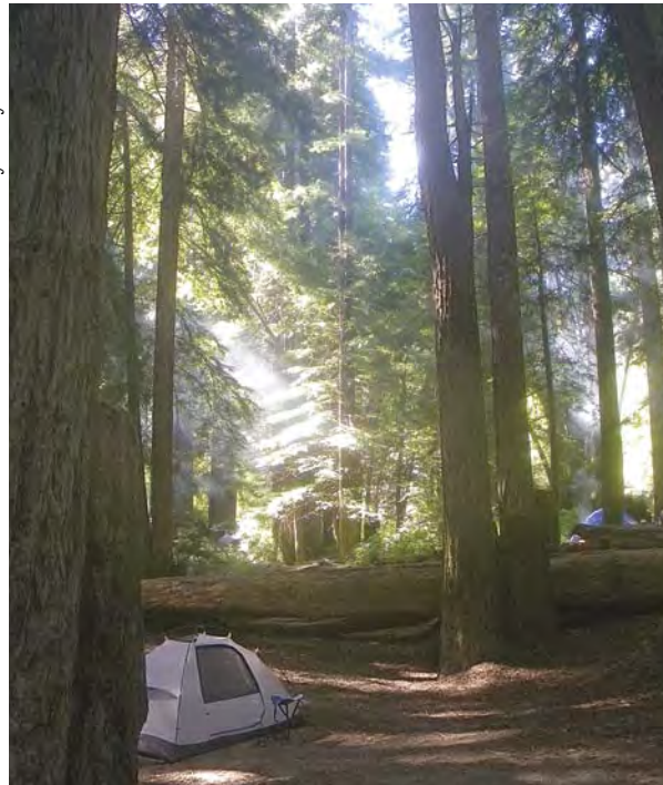
Paul M. Dimmick campground