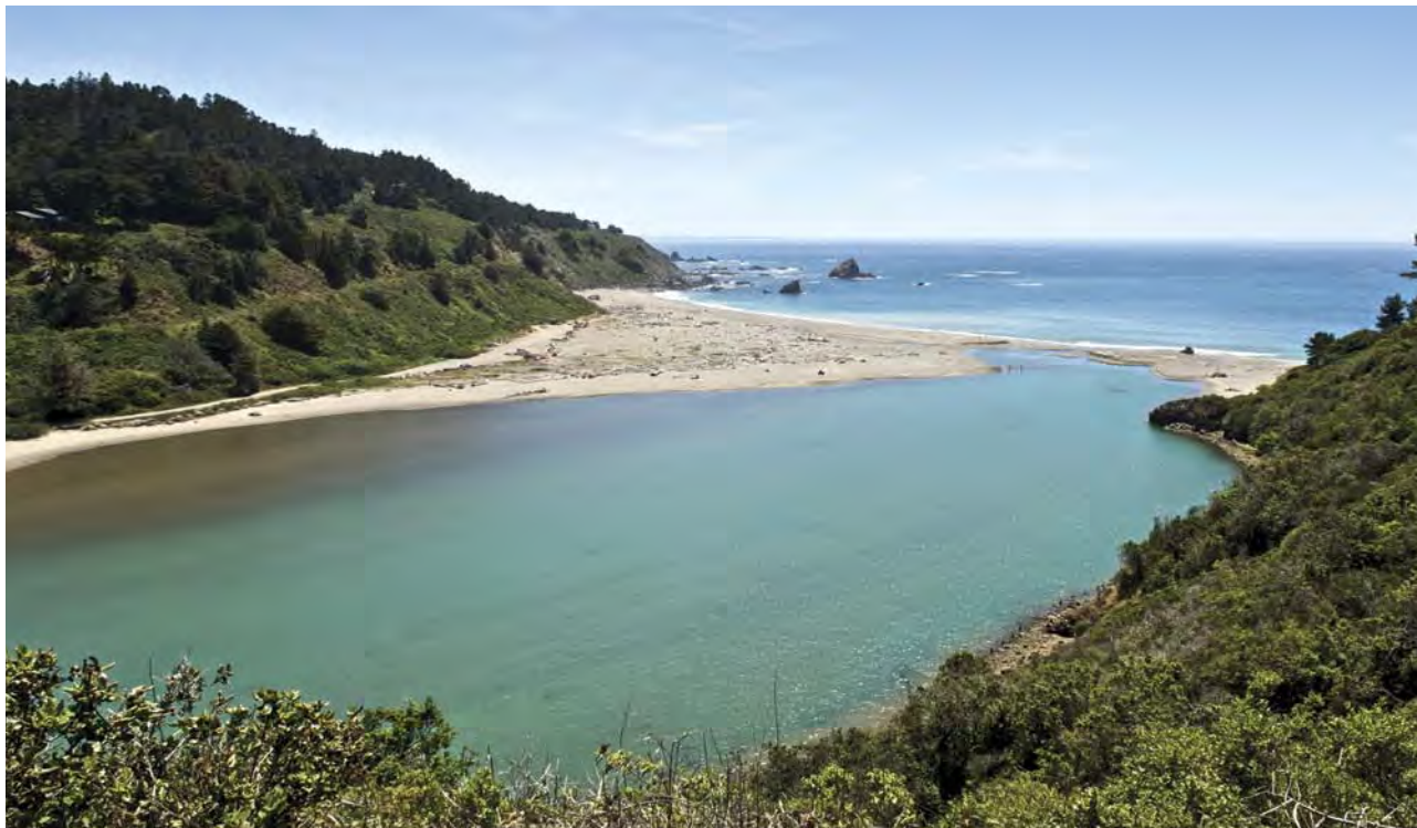
Navarro Beach at the mouth of the Navarro River

The mouth of the Navarro River mingles fresh water and salty ocean water to support a great variety of wildlife, including harbor seals, river otters and California sea lions. Mountain lions may be spotted at dusk or dawn seeking a resident raccoon or a black-tailed deer.