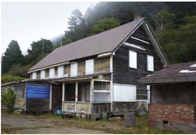
Captain Fletcher's Inn

Belted kingfishers, grebes, mergansers, buffleheads, egrets and herons feed in and along the river, while airborne raptors such as osprey and red-tailed hawks circle the skies looking for food.