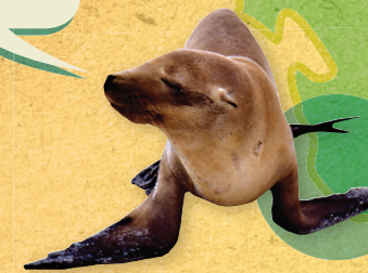
CALIFORNIA SEA LION

I'm curious and playful, and I can get tangled in trash.