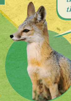
SAN JOAQUIN KIT FOX

A little litter gets me into big trouble.