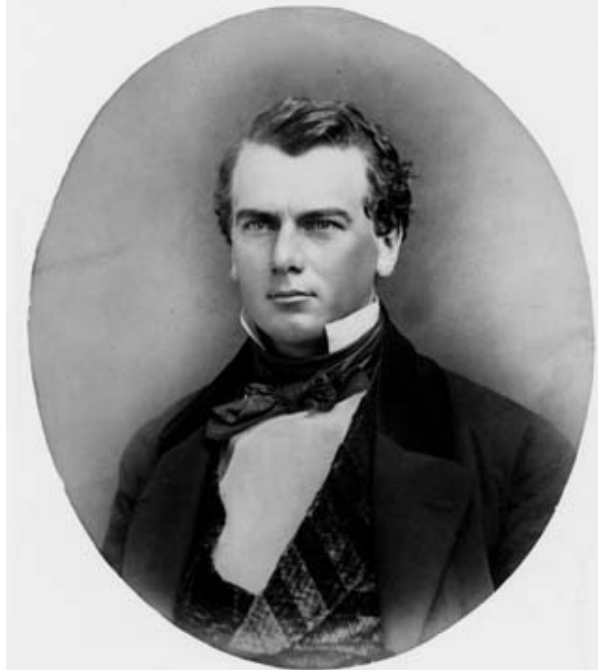
Gen. Phineas Banning

Banning's stages traveled between San Pedro and Wilmington, named for his birthplace, and later between Banning, California and Yuma, Arizona. (Banning was named after Phineas Banning.) Some of his notable passengers included Governor James Throckmorton of Texas, and Governor R.C. McCormick of Arizona.