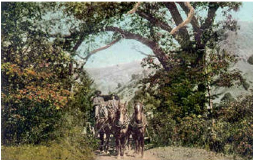
A postcard of the Calistoga and Geyser Stage on Foss Road, in 1905