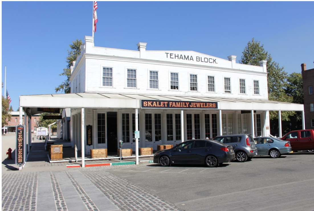
The Historic-Style Jewelry Store Concession is located on the ground floor of the Tehama Block Building at 935 Front Street in Old Sacramento.