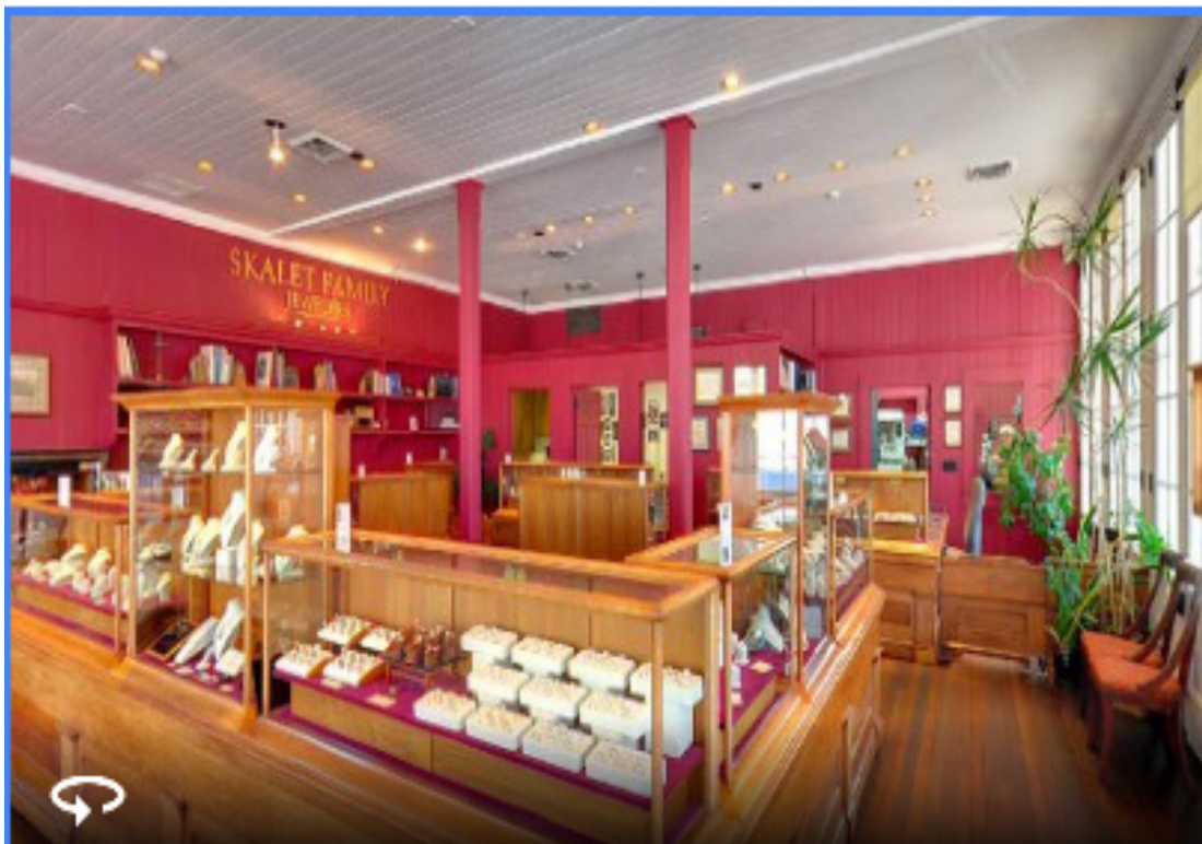
An inside look at the main merchandise displays and floor design.