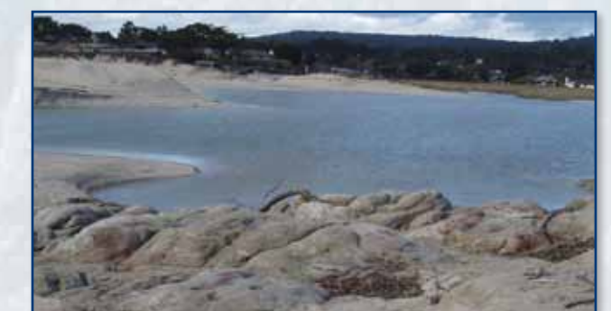
Mortars at Ohlone Coastal Cultural Preserve