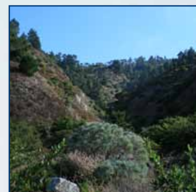
San Jose Creek Canyon