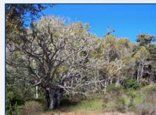
San Jose Creek Canyon