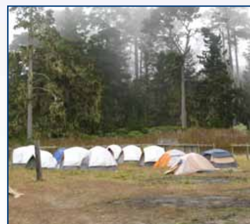
Temporary Trail Crew Camp