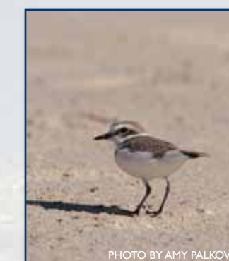
western snowy plover