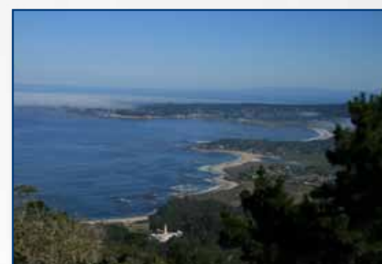
View from Red Wolf Drive