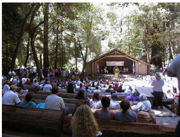
Historic campfire center