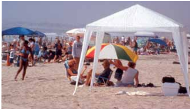
Silver Strand State Beach

RV campsites may be reserved by calling (800) 444-7275 or visiting www.parks.ca.gov .