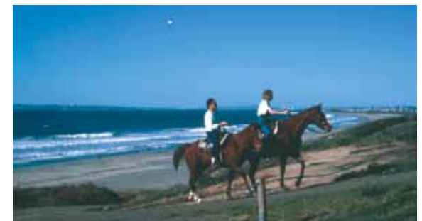
Border Field State Park