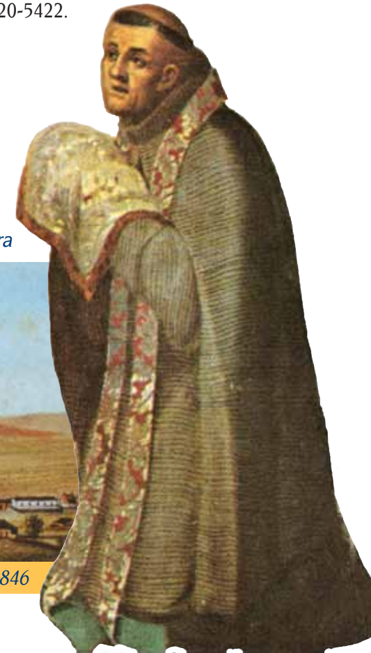
Father Junípero Serra