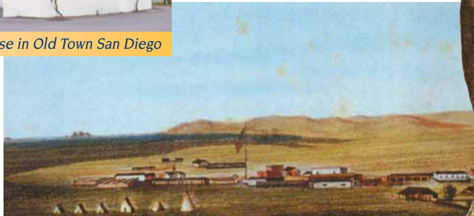
Painting of early San Diego by Lt. William H. Emory, 1846