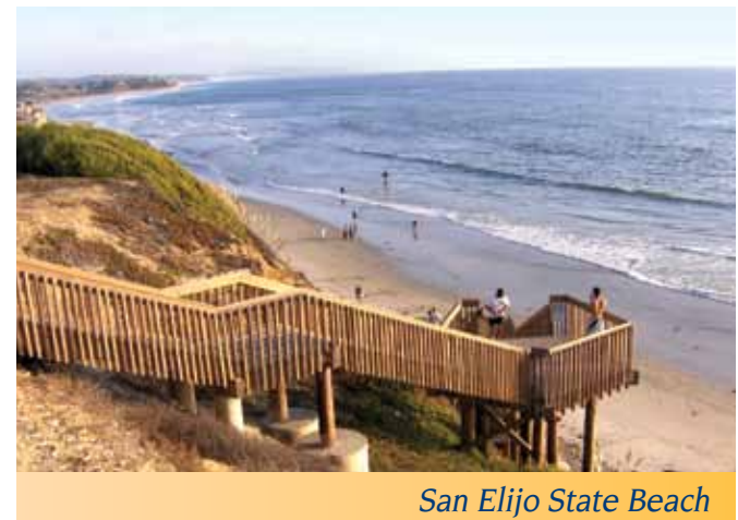
San Elijo State Beach

San Elijo State Beach, with two miles of coastline, is mainly a campground, but