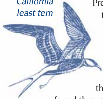
California least tern

found throughout the southern California coast and is now rare. Nesting sites for the California least tern and Western snowy plover are also found here. Call (619) 435-5184 for information.