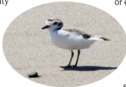
Endangered Western snowy plover