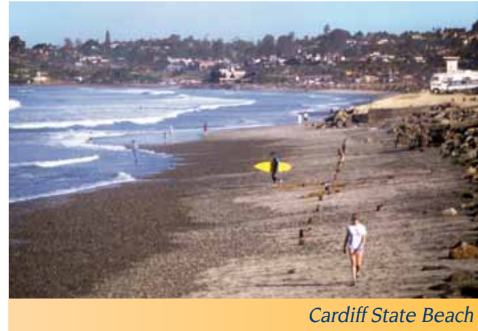
Cardiff State Beach

The park has 220 campsites and two day-use areas. Ponto Day-Use Area, south of the campground, has restroom