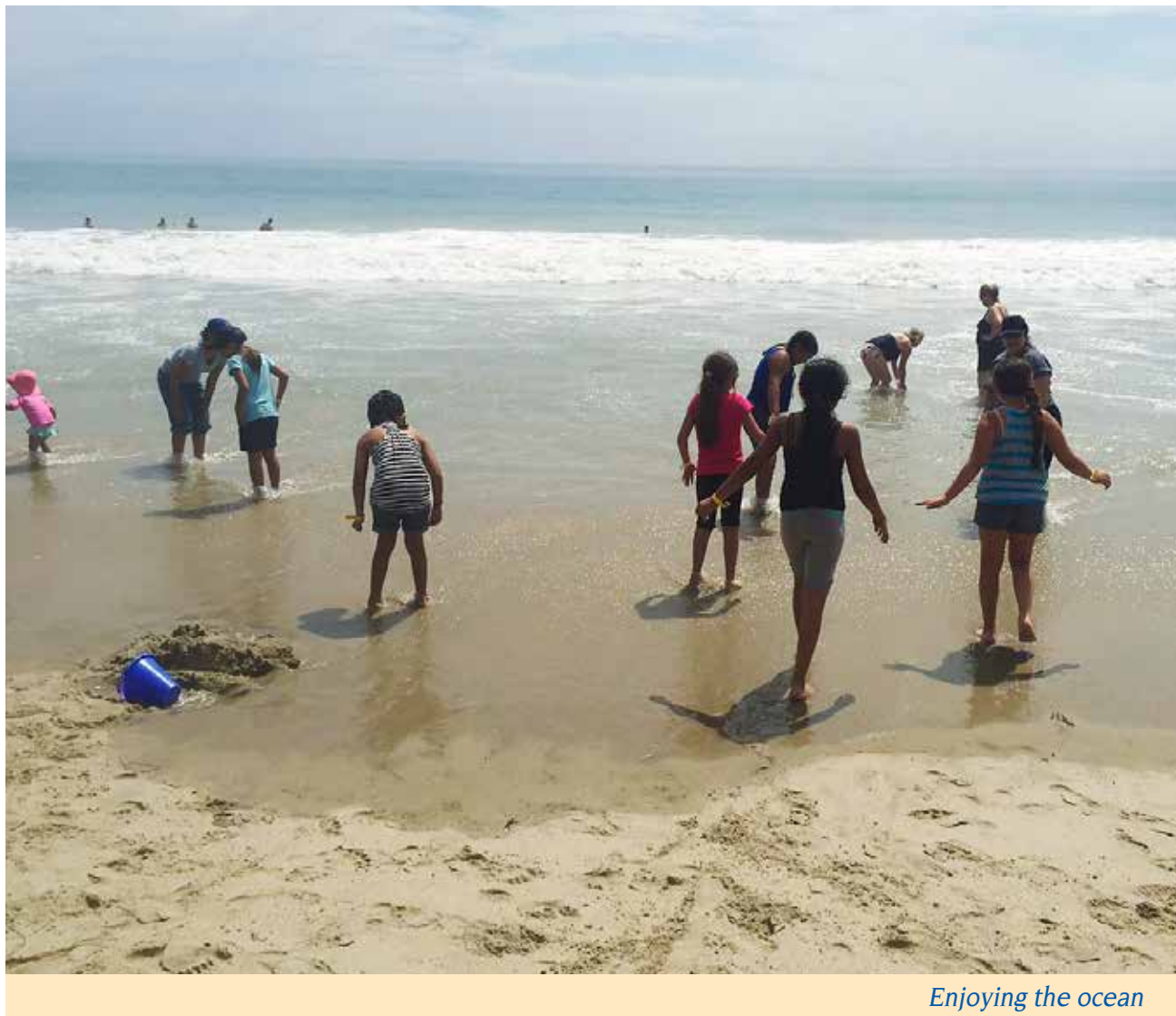
Enjoying the ocean

This park receives support in part through a nonprofit organization. For information, contact the San Onofre Foundation 3030 Avenida del Presidente San Clemente, CA 92672 (949) 366-8599 www.sanonfreparksfoundation.org