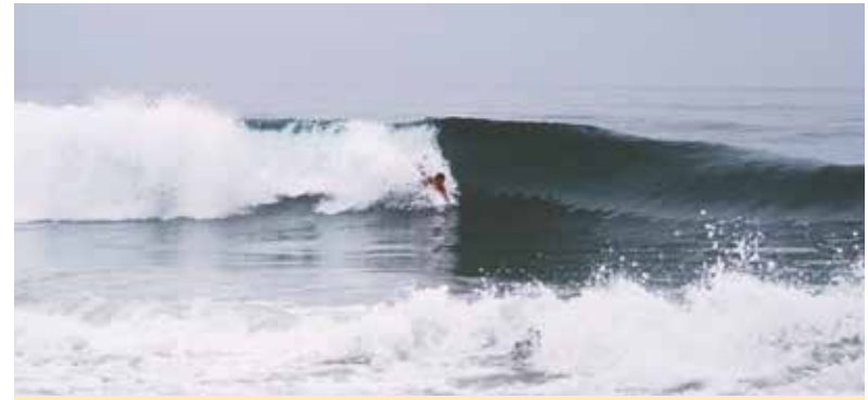
Riding the surf

The park’s sandstone bluffs present a visual history of its geology. The bluffs are remnants of marine terraces formed under the ocean eons ago and sculpted by countless