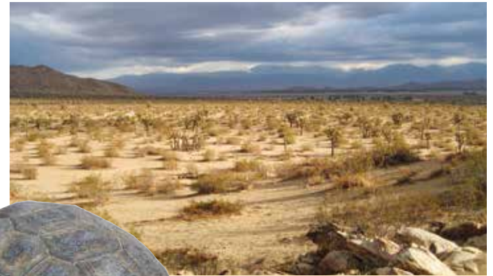
Mojave desert rain clouds

Daytime visitors may see foxes, rabbits, and desert tortoises—a burrowing reptile and threatened species. Beware of desert rattlesnakes searching for rodents in the evenings. Among rattlesnakes, Mojave