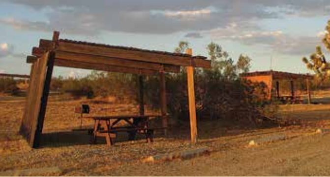
Campsites at sunset

Butte Peak Trail. The main park road links these two trails in a three-mile loop, or climb to the peak and enjoy a 360-degree view over Antelope Valley and the Mojave desert.