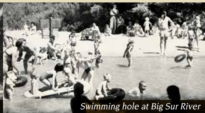
Swimming hole at Big Sur River