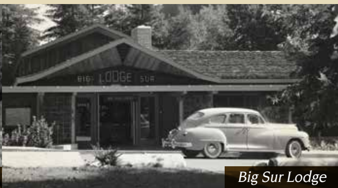
Big Sur Lodge