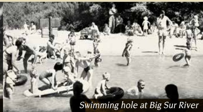
Swimming hole at Big Sur River