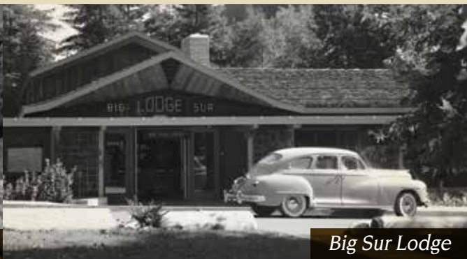
Big Sur Lodge