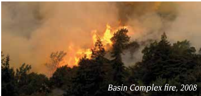
Basin Complex fire, 2008