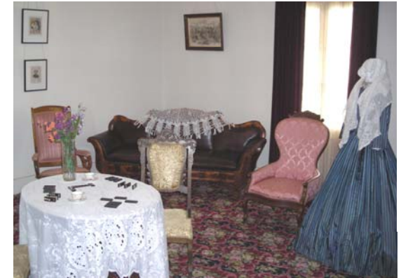
Stop 604, Guest Parlor