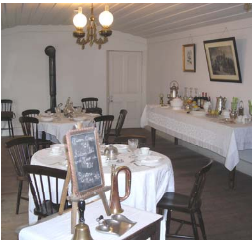
Stop 602, Dining Room