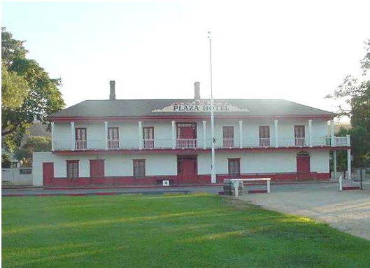
Stop 601, Introduction