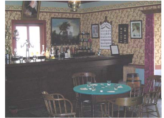
Stop 603, Saloon