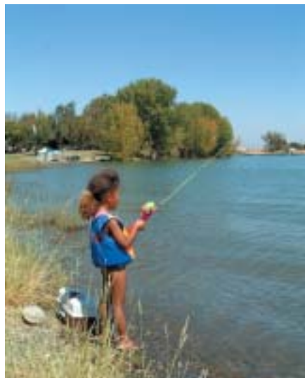
Fishing on the lake

Wildflowers decorate the grassland and hillsides with lupine, fuschias, sunflowers, monkeyflowers, larkspurs, wallflowers and Mariposa lilies. Woodwardia ferns grow in moist places along the cliff, and a multitude of other flowers, shrubs and ferns infuse color throughout the area.