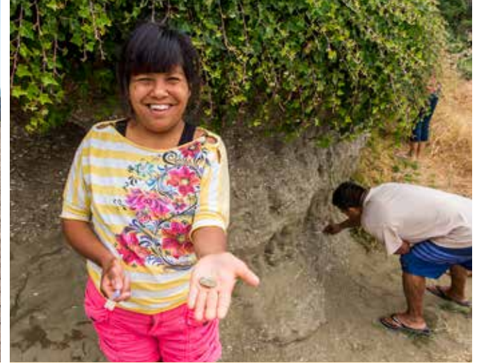
Children learn about fossils from docents.

Site-specific camping reservations for both beaches may be made by calling (800) 444-7275 or visiting www.parks.ca.gov .