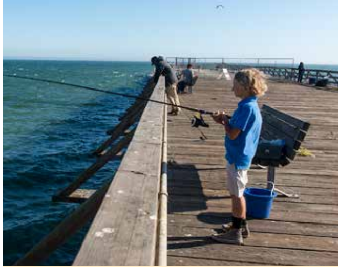
Fishing from the pier