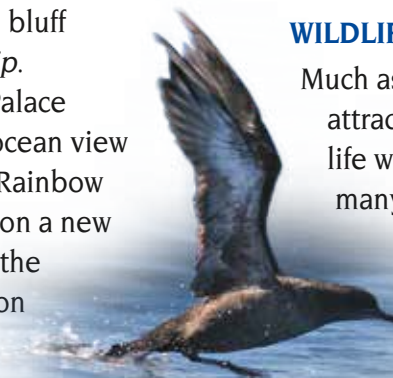
Sooty shearwater

Much as a reef does, the SS Palo Alto attracts an immense variety of marine life within its concrete wreckage, and many of the same animals found on rocky shores live on it. Mussels, barnacles, sea stars, sea anemones, ocean worms,