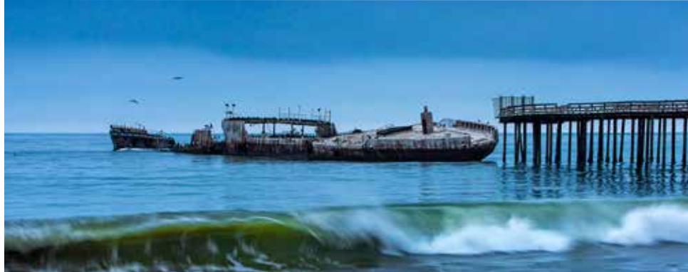
SS Palo Alto

Seacliff became one of California's first state beaches in 1931. For more than 80