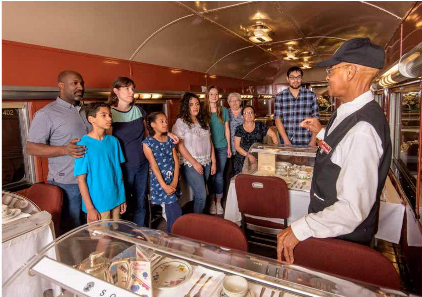
Dining car docent explains meal service.