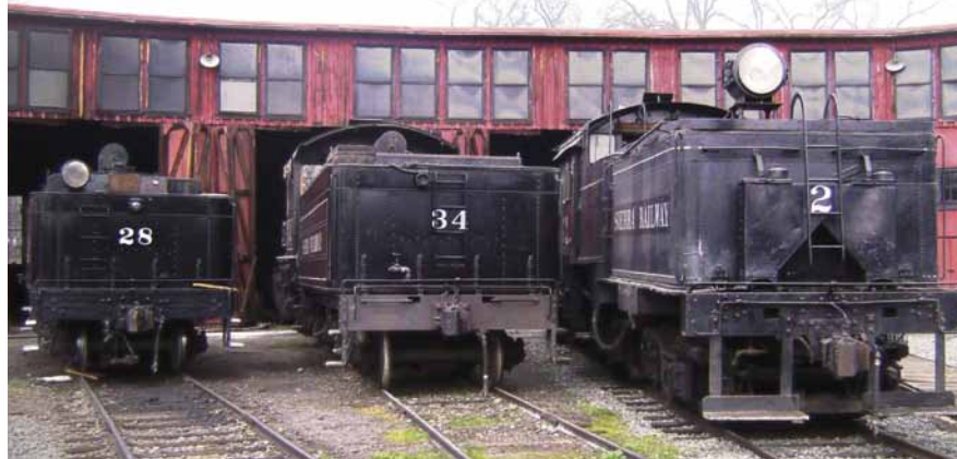
Locomotives stored at roundhouse