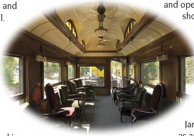
Interior, first-class observation car

The Sierra Railway Company also established working relationships with the Southern Pacific Railroad Company and several stage lines to serve mining, lumber and agricultural interests. However, as the costs of gold mining increased with the onset of World War I, the Railway's profits decreased. Even worse, trucking companies had begun competing with trains.