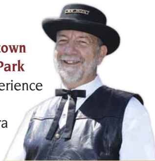
Volunteer Car Host