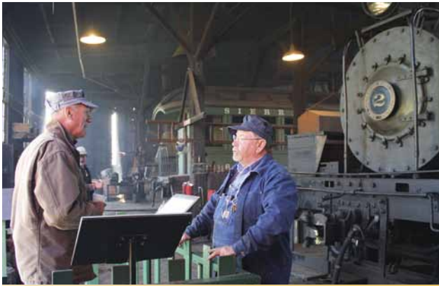
Workers in roundhouse

days of steam transportation, including three locomotives original to the railroad. The railroad's operations and maintenance trades continue to be preserved.