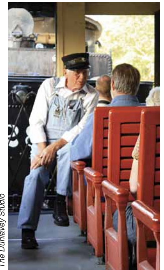
The Durnlavy Studio