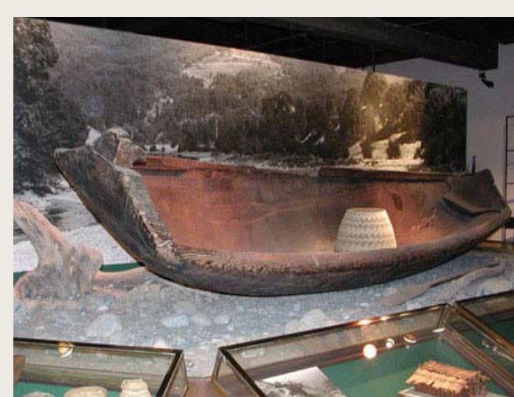
California State Indian Museum (redwood canoe)

The museum displays a comprehensive collection of artifacts relating to California Indian culture. Wheelchair accessible. Groups without reservations are admitted on a space available basis. Carrying capacity enforced. (30 min -Self-guided Tour)