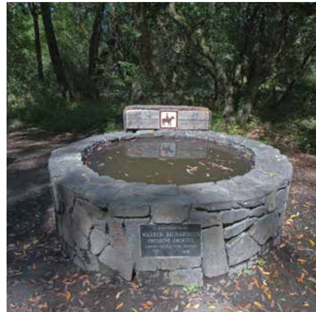
Warren Richardson horse trough

Ledson Marsh —First built as a reservoir to water eucalyptus trees, the marsh is now mostly overgrown with cattails, tules, and native grasses. During the winter months, water collects here and overflows into Schultz Canyon. The bridge at this spillway helps to protect the rare California red-legged frog.