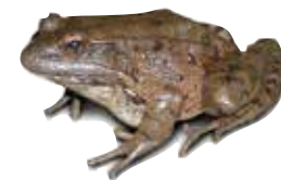
California red-legged frog

Canyon Trail (fire road) —This two-mile trail begins at the intersection of Spring Creek Trail near a wooden bridge. The trail's elevation increases steadily. At the top, discover a panoramic view of Santa Rosa, the Mayacamas Mountains with the Geysers, and Mount Saint Helena. Colorful Indian warriors plants bloom from March through May at the Marsh Trail intersection. Canyon Trail ends at the lake after passing by Hunter Spring, where a horse-watering trough is located.