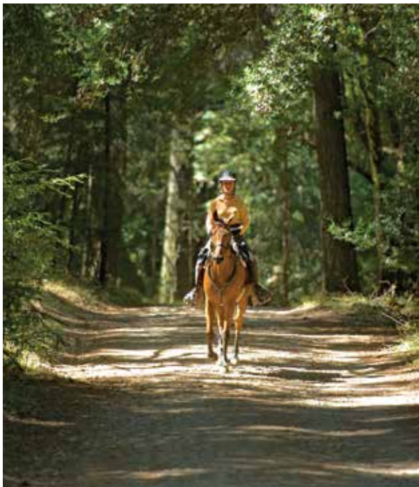
Warren Richardson Trail