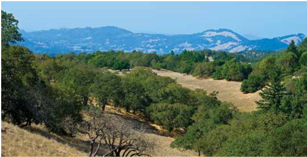
Mayacamas Mountains in the distance

Marsh Trail —This trail climbs steadily from its beginning at the intersection with Canyon Trail. Marsh Trail skirts the northern flank of Bennett Mountain. Higher elevations provide views of Lake Ilsanjo and the Mayacamas Mountains. The trail runs through prime oak woodlands, grasslands, and cool islands of coastal redwoods.