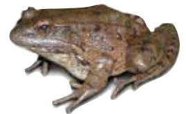
California red-legged frog

Marsh Trail —This trail climbs steadily from its beginning at the intersection with Canyon Trail. Marsh Trail skirts the northern flank of Bennett Mountain. Higher elevations provide views of Lake Ilsanjo and the Mayacamas Mountain Range. The trail runs through prime oak woodlands, grasslands, and cool islands of coastal redwoods. Threatened California red-legged frogs, popularized by Mark Twain's The Celebrated Jumping Frog of Calaveras County , live at Ledson Marsh, where the trail terminates. (Please step with care.) The structures attached to various trees surrounding the marsh are nesting boxes for wood ducks.