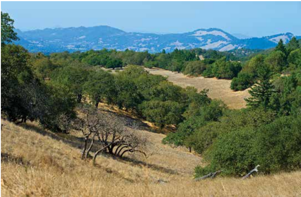
Mayacamas Range in the distance

North Burma Trail —This route begins a third of a mile beyond the visitor center on Channel Drive. Follow a seasonal creek that receives its water from False Lake Meadow, a highland vernal pool, before passing through areas of chaparral and mixed forests. In the vernal pool near the Live Oak Trail area, look for tiny, very rare, white fritillary flowers blooming from March through May. The trail borders several meadows and ends at the Warren Richardson Trail, where there is a wonderful view of Lake Ilsanjo.