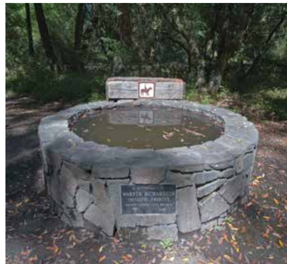
Warren Richardson horse trough

Accessibility is continually improving. For updates, visit http://access.parks.ca.gov .