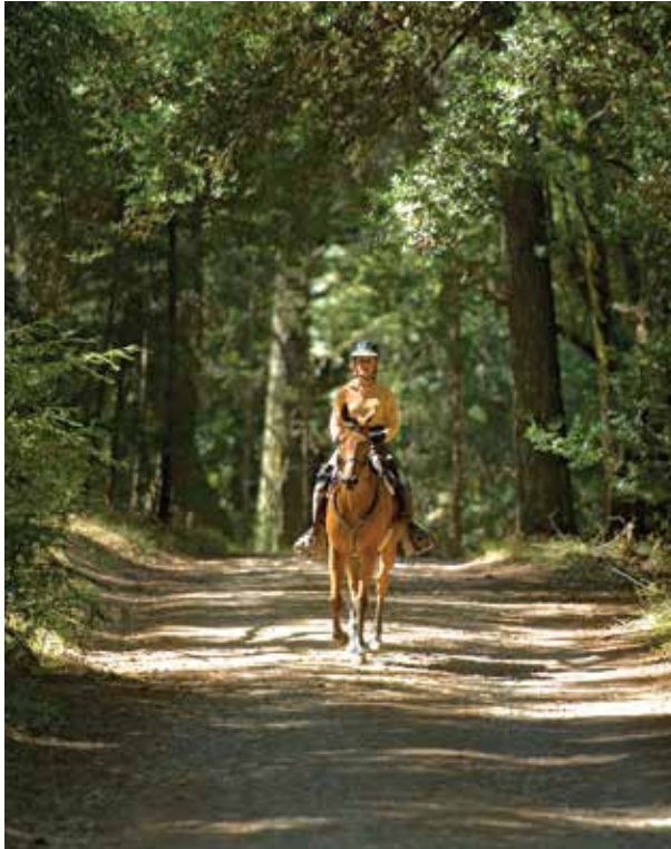
Warren Richardson Trail

Hikers, equestrians, mountain bicyclists, runners, and nature-lovers can choose among more than 40 miles of trails. Elevation gains and degree of difficulty vary with each trail.