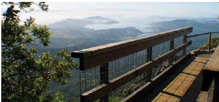
Spectacular views of the San Francisco Bay area can be seen from the Verna Dunshee Trail near East Peak.

Camping —Several campgrounds are open all year. The Pantoll Campground, on the Panoramic Highway, has 16 sites approximately 100 yards from the parking area. Drinking water, firewood and restrooms with flush toilets are nearby. There are no showers. Campsites are available first-come, first-served.