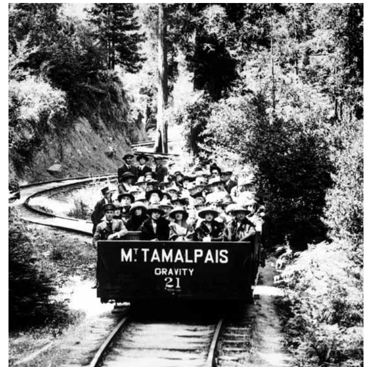
Gravity car on Mount Tam's Scenic Railway, ca. 1900