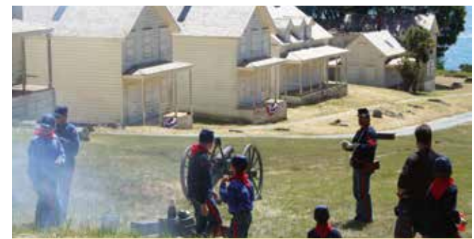
Civil War reenactment at Camp Reynolds

A 1940 fire destroyed the administration building, closing the Immigration Station. The first restoration phase of this National Historic Landmark has been completed as a tribute to immigrants from around the world.