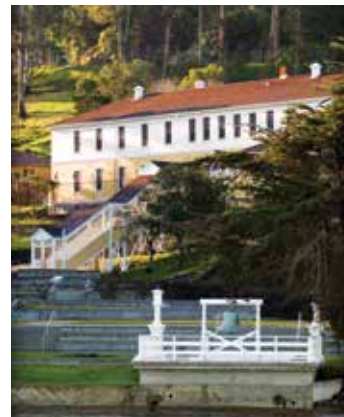
U.S. Immigration Station

From 1910 to 1940, the United States Immigration Station (USIS), nicknamed