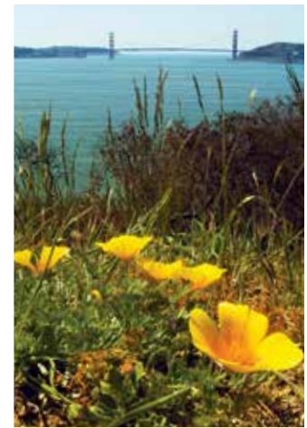
Golden Gate Bridge view

For more activity information, visit www.angelisland.com or call (415) 435-3392.