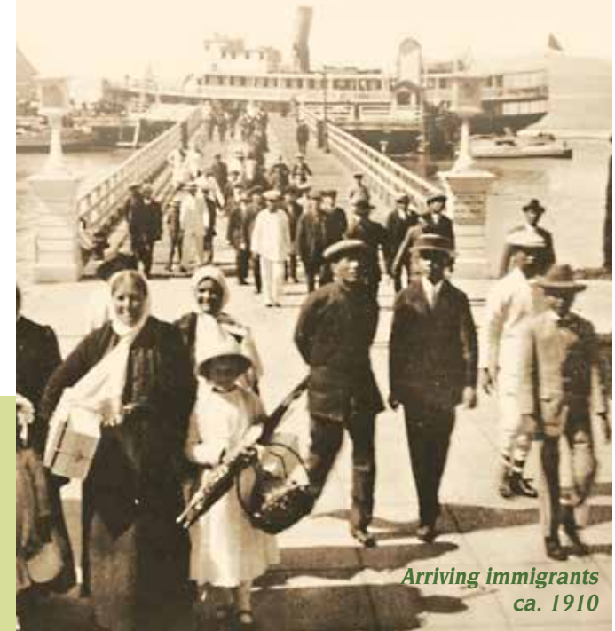
Arriving immigrants ca. 1910

Angel Island played a major role in the settlement of the West and as an immigration station. Trails and roads crisscross the island, providing easy access to historic sites and breathtaking views of San Francisco, Marin County, and the Golden Gate Bridge.