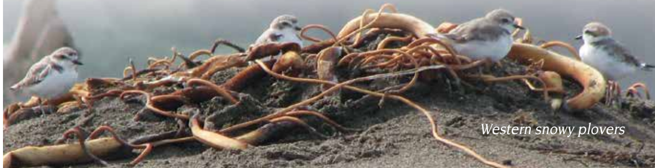
Western snowy plovers

Allowing any dog in an area where snowy plovers nest can cause the parent to use precious energy reserves to flee or seek cover—abandoning a nest with eggs or immature chicks and exposing them to predators and the elements. Staying a safe distance from sensitive species and their habitats is vitally important.