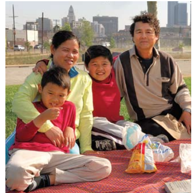
Family picnickers escape city bustle.