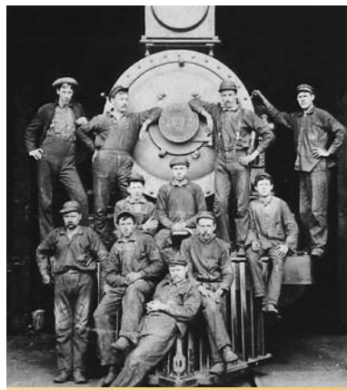
Locomotive and workers in Roundhouse

Many Tongva villages occupied the fertile basin that is now Los Angeles. One large village, Yang-na , sat within a mile of today's park. The Tongva were renamed Gabrieleño after Mission San Gabriel was founded in 1771.