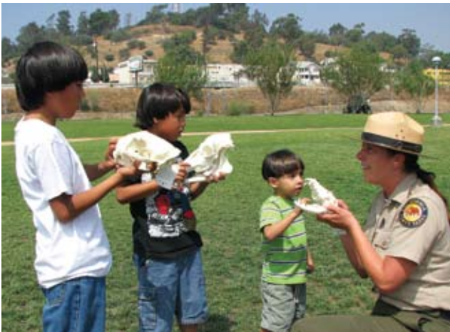
Brothers learn about animal skull replicas.

Although surrounded by intensely developed and populated areas, Los Angeles State Historic Park offers a quiet sanctuary with California sycamores and lush green grass. Due to encroachment on the natural habitat and the paving of the adjoining Los Angeles River bed, local animal species have diminished; however, red-tailed hawks and kestrels still soar overhead while killdeer and mourning doves dart among the deer grass and soft chess. Beechey's ground squirrels inhabit the trees, and nocturnal opossums and raccoons may forage at night. The nearby Pacific Flyway is used by a wide variety of migrating birds.