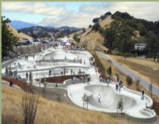
MCINNES SKATE PARK IN MARIN COUNTY, A PER CAPITA PROJECT

This program allocated funds to cities, counties, and eligible districts through a population-based formula for the acquisition and development of neighborhood, community, and regional parks and recreation lands and facilities in urban and rural areas. A total of 1,888 projects were completed.