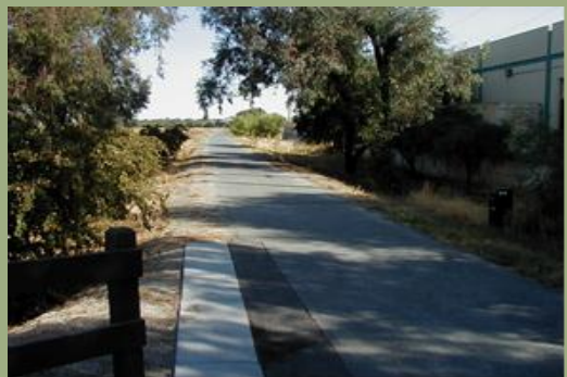
IRON HORSE TRAIL IN ALAMEDA COUNTY, A NON-MOTORIZED TRAILS PROJECT