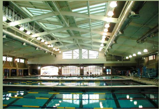
AQUATIC CENTER IN CITY OF EL MONTE, RZH BLOCK PROJECT

This program funded 30 grants for the development, improvement, rehabilitation, restoration, and enhancement of non-motorized trails and associated interpretive facilities for the purpose of increasing public access to, and enjoyment of, public areas for increased recreational opportunities.