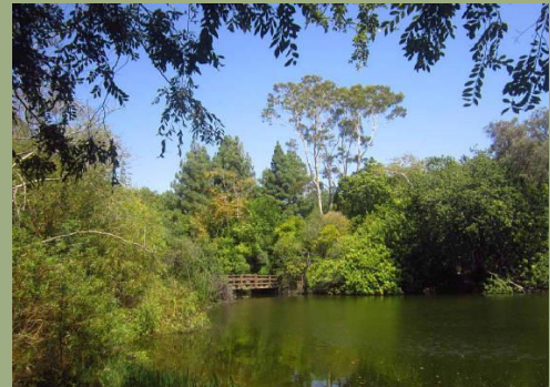
EL DORADO NATURE PARK IN LONG BEACH, A RIPARIAN AND RIVERINE HABITAT PROJECT

This competitive program awarded 35 grants to increase public recreational access, awareness, understanding, enjoyment, protection, and restoration of California's rivers and streams. Eligible projects included the acquisition, development, or improvement of recreation areas, open space, parks, and trails in close proximity to rivers and streams. All projects included a riparian or riverine habitat enhancement element and also provided for public access.